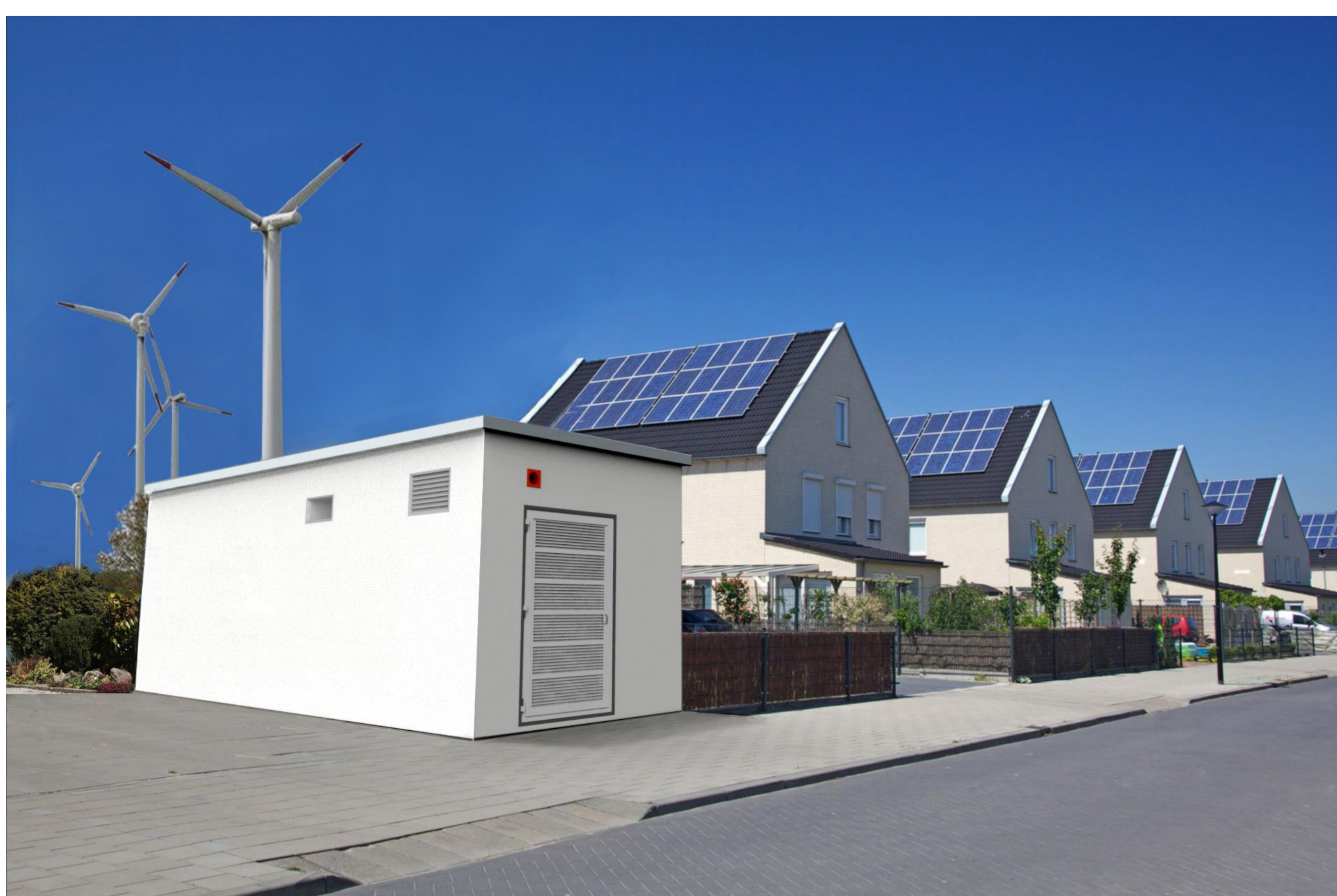
Visual integration of the storage system in district areas