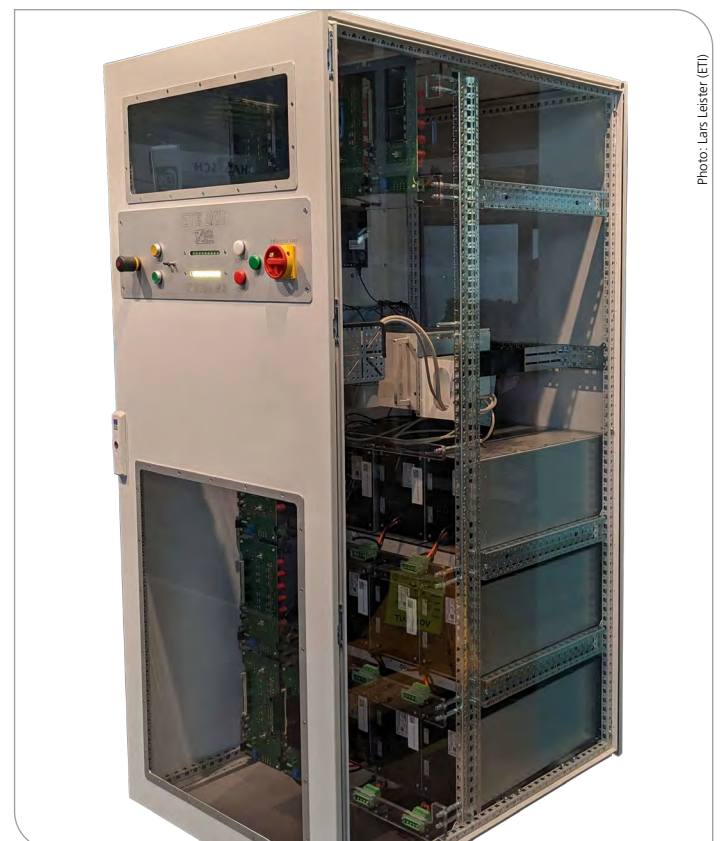
Switch cabinet (arm) - one of the six arms of the overall system.

In order to be able to operate batteries of different types and ages in the MMC and to optimize their service life, the charging and discharging power is strategically distributed. This means, for example, that an older battery module is charged slower than a brand-new module of the same type. Optimized operation also makes it possible to reduce the installed storage capacity. This allows for the implementation of more cost-effective systems with identical properties.