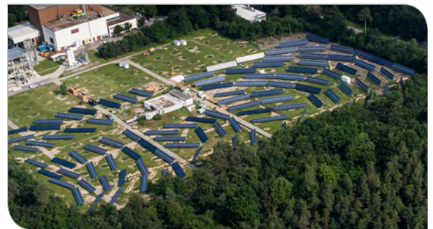
Solar-storage facility on KIT's north campus

In a large-scale experiment with more than 100 photovoltaic arrays installed at different orientation and tilt angles, KIT evaluates the daily energy yield for each configuration throughout the year. The surprising result is that to satisfy the energy demand of an average German household, the orientation is practically irrelevant. In addition to the typical south-facing orientation, both west- and east-facing solar panels can deliver sufficient power. The same applies for the