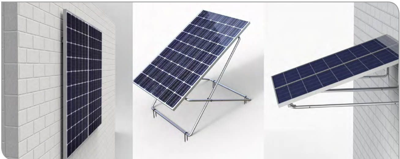
KIT's close-to-production mounting solutions

The KIT service portfolio comprises customised developments of PV installation systems as well as licensing for the mounting solutions already developed.